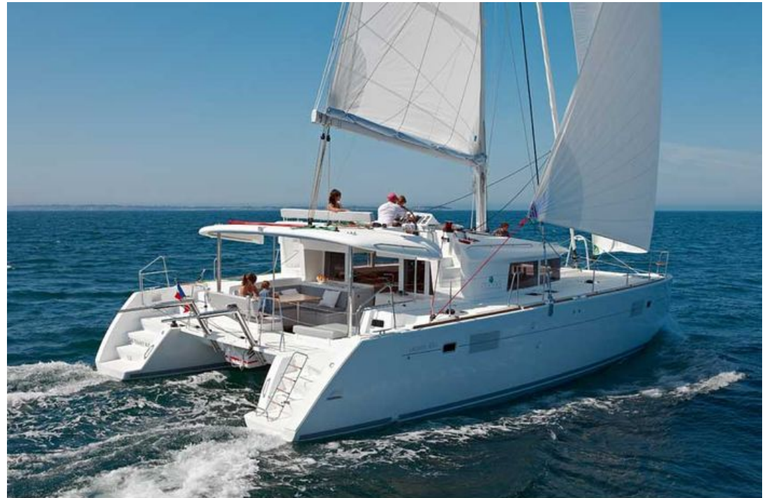
Lagoon 450

Type Modern Propulsion Sail Hull Catamaran Length 13.9m (46') Hull Material Fiberglass